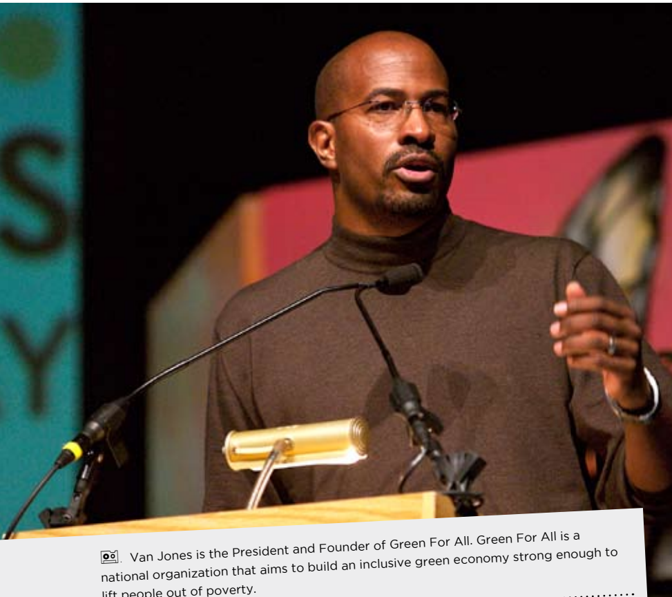
Van Jones is the President and Founder of Green For All. Green For All is a national organization that aims to build an inclusive green economy strong enough to lift people out of poverty.